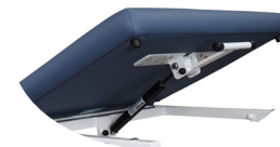
Basic equipment: Head part adjustment by gas spring

All pictures: Model 177-04 in basic equipment; upholstery colour 64-153 platin