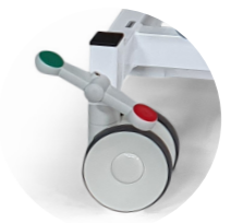
Art. no. 1185 Movable on comfort twin castors, Ø 125 mm with central lock, basic height + 50 mm