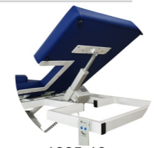
Art. no. 1665-10 Electric motorized head part adjustment to +60°