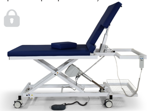
Model 2550-00XLE with options: Movable on comfort twin castors, each with lock (1120N-10), storage basket (1850), electric motorized head part adjustment (1665-10)