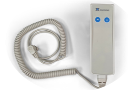
Art. no. 1920E Hand switch (low voltage), with magnet on the back to fasten