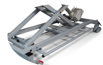
Art. no. 1950E Foot switch rail, lateral, on both sides, security adjustment