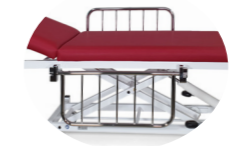
Art. no. 1040 1 side guard tiltable, chromium-plated, completely made of steel tube, length: 700 mm