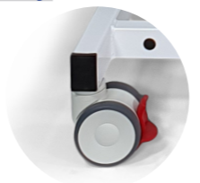
Art. no. 1120N-10 Movable on comfort twin castors Ø 100 mm, each with total lock, basic height -15 mm