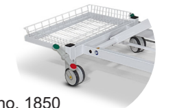
Art. no. 1850 Storage basket