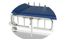
Art. no. 1005 1 side guard to fit on side rail, with attachment clamp, chromium-plated, length: 800 mm