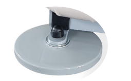
Art. no. 1170 1 wall protection bumper Ø 150 mm