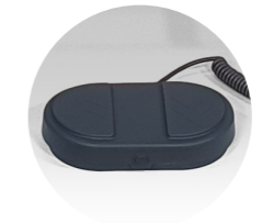
Art. no. 1910E Foot switch (low voltage)