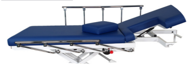
Art. no. 1080-50 1 side guard lateral lowerable, chromium-plated, completely made of steel tube, length: 1060 mm, length on cut-out side: 820 mm