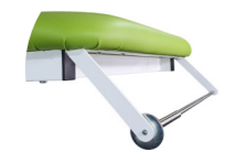
Art. no. 1270F / 1280F Paper roll holder, mounted at foot part (protruding: 70 mm), for width 700 mm / 800 mm