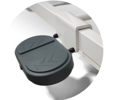
Art. no. 1940E 1 foot switch fixation mounted at underframe