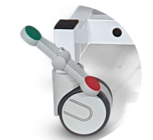
Art. no. 1180N Movable on twin castors, Ø 100 mm with central lock, basic height +20 mm