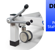
Art. no. 1045N Wheel-lifting/fixing mechanism with 4 foot levers for controlled lowering