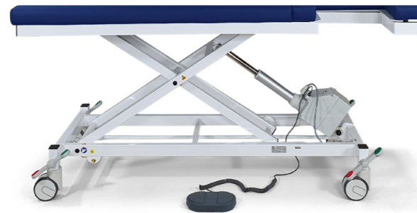
Frame in case of electric motorized height adjustment