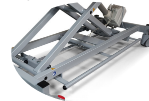
Art. no. 094E Foot switch rail, lateral, on both sides, security adjustment: Press the switch rail down = the table is lifted Lift the switch rail up = the table is lowered