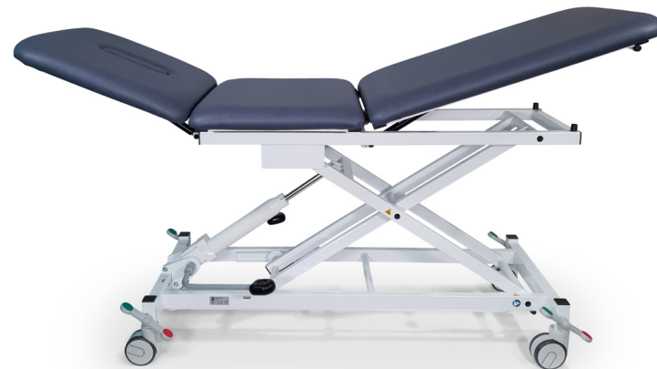
Model 2815-00XL/H (hydraulic height adjustment) with option: Movable on twin castors with central lock (046); upholstery colour: 64-716 black