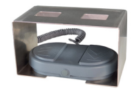
Art. no. B1997E Foot switch cover, made of brushed VA-steel