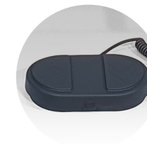
Art. no. 091E Foot switch (low voltage)