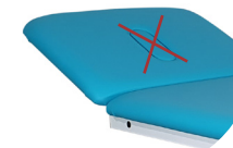
Art. no. 1615-EF Loss of nose opening and upholstery part to close