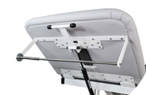
Art. no. 010K Paper roll holder, mounted under head part (not protruding), for width 700 mm, not in case of 3-sectioned head part (Art. no. 056)