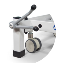
Art. no. 045N Wheel-lifting/fixing mechanism with 4 foot levers for controlled lowering