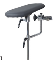
Art. no. B1440 1 arm rest for side rail, without attachment clamp, swivelling and removable, additional revolving and tiltable