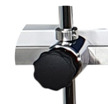
Art. no. B1430 1 attachment clamp for side rail, suitable for pipe: Ø 18 mm