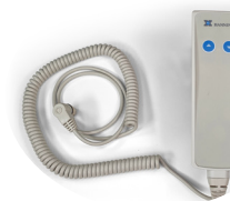
Art. no. 090E Hand switch (low voltage), with magnet on the back to fasten