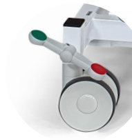
Art. no. B1185 Movable on comfort twin castors, Ø 125 mm with central lock, basic height + 50 mm