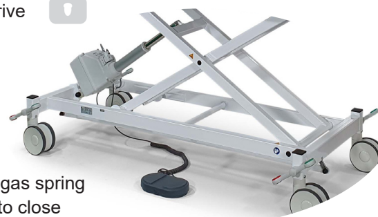
Under part in case of electric motorized height adjustment