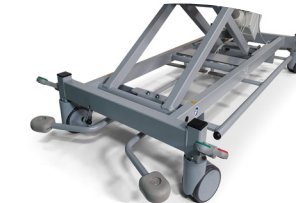
Art. no. 095E Foot switch rail, surround, security adjustment: Press the switch rail down = the table is lifted Lift the switch rail up = the table is lowered