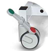
Art. no. 046 Movable on twin castors, Ø 100 mm with central lock, basic height +20 mm