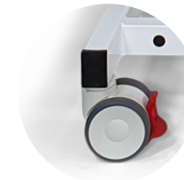
Art. no. 040N Movable on comfort twin castors Ø 100 mm, each with total lock, basic height -15 mm